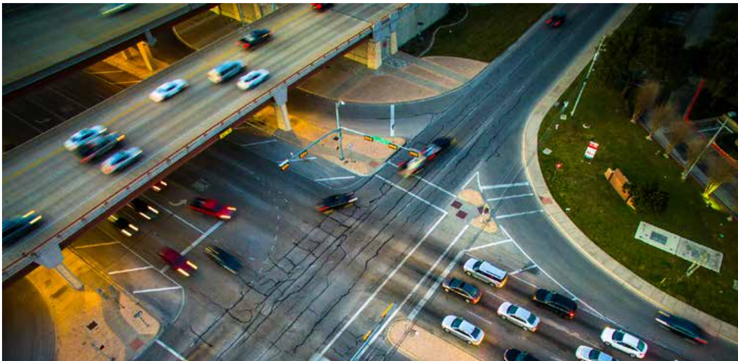
A drone monitors traffic at a busy intersection in the Round Rock area of Austin, Texas.

The agency also stated that “the FAA will address preemption issues on a case-by-case basis rather than doing so in a rule of general applicability”. 19 To date, the FAA has not taken legal action to challenge a city or state’s drone related laws. Moreover, cities have for years regulated the flight of remote controlled aircraft within cities and the FAA has not taken preemption action against these decades-old ordinances.