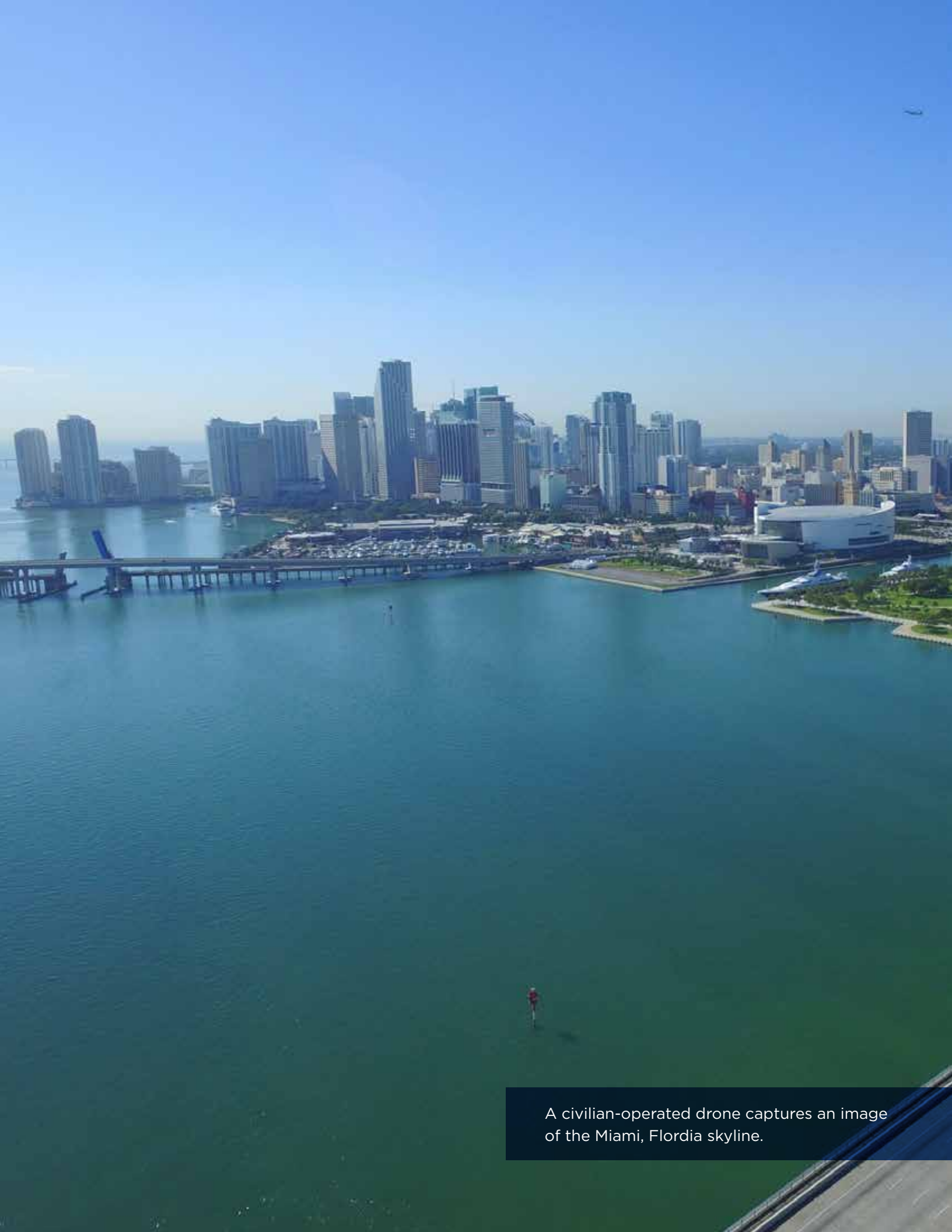
A civilian-operated drone captures an image of the Miami, Florida skyline.