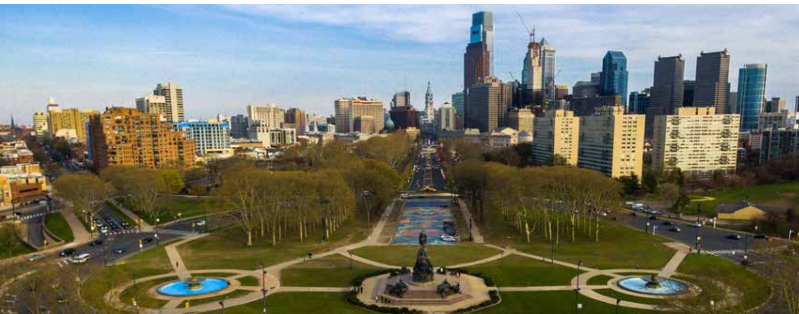
A drone is used to capture a panoramic view of the Benjamin Franklin Parkway in Philadelphia, Pennsylvania. Drones have enabled the public to capture stunning photos that would have been prohibitively expensive in the past.