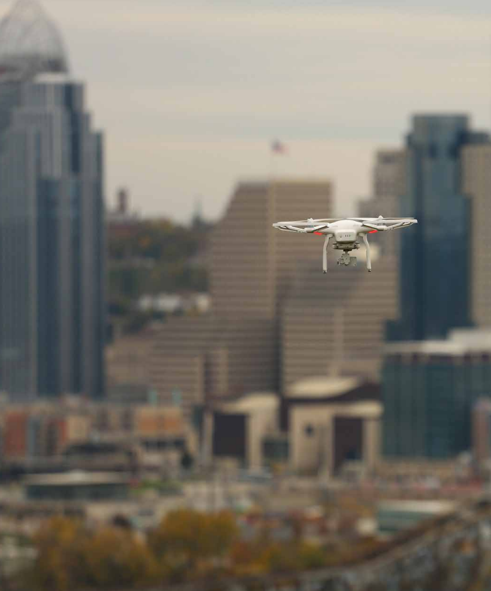
A drone hovers near the Cincinnati, Ohio skyline.