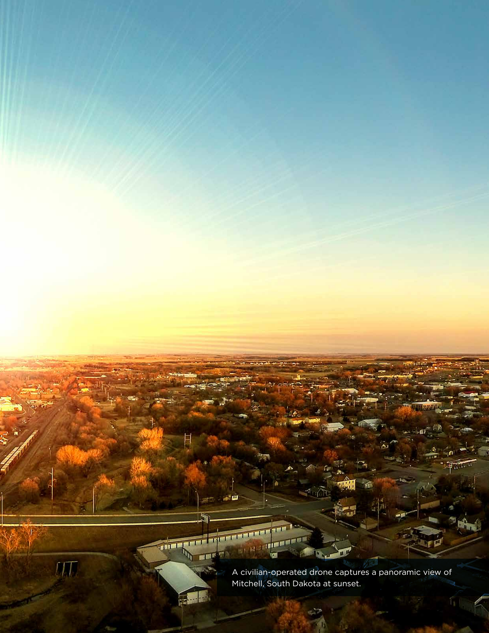
A civilian-operated drone captures a panoramic view of Mitchell, South Dakota at sunset.